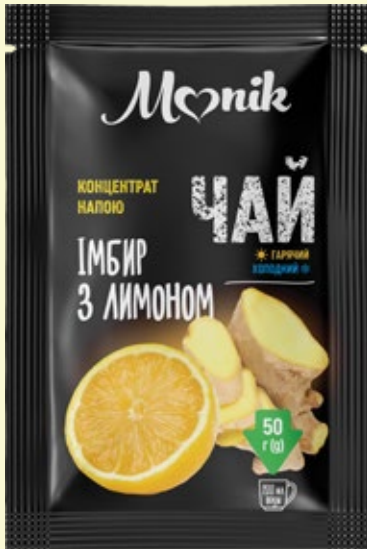
GINGER & LEMON