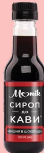
CHERRY & CHOCOLATE