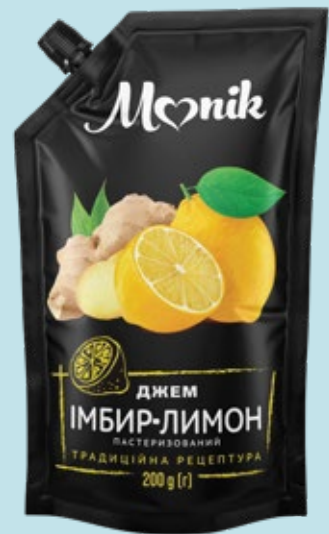
GINGER & LEMON